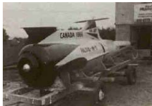
Two views of Papp's submarine